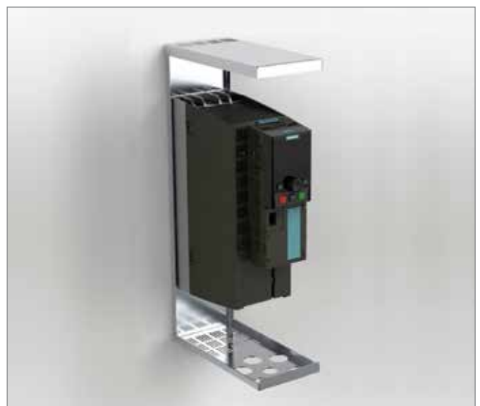
Figure 2: Example of a Siemens UL Type 1 kit mounting bracket, which provides easier access for installation, wiring and maintenance.