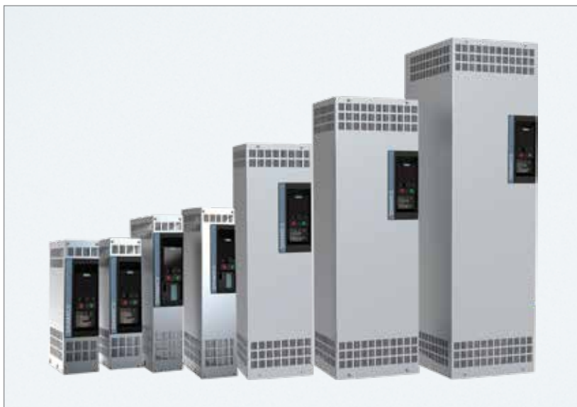
Figure 3: Example of the Siemens UL Type 1 kit enclosure from fractional to 200 hp.

In conclusion, for maximum protection of property, equipment and personnel, it is highly advisable to consider the differences between the NEMA 1 and UL Type 1 enclosures for low-voltage electric drives. These ratings are not equivalent and the independent lab testing done by UL has substantial merit, when sourcing products for a wide variety of new construction, new equipment and retrofit upgrades, both indoor and outdoor, stationary and mobile.