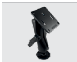
Ball joint mount